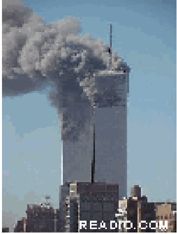
September 11 th , Courtesy of Readio.com

Canada recently articulated its first National Security Policy (NSP), Securing an Open Society . It addresses three main security interests: