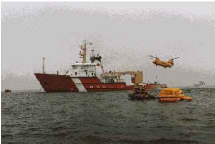
Canadian Coast Guard, courtesy DFO

The main threats of concern to Canada as identified in the NSP are: terrorism; proliferation of weapons of mass destruction; failed and failing states; foreign espionage; natural disasters; critical infrastructure vulnerability; organized crime and pandemics.